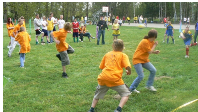
Several times each year we invite other schools and orphanages to much appreciated sports events.

You can become a COLLABORATION PARTNER with a long-term commitment, a LIVSLUST-SPONSOR and pay a monthly amount of your own choice or you can make a SINGLE DONATION in connection with Christmas or other events. You can HOST a couple of our youngsters in the summer. You can BUY PRODUCTS made in our workshops. Contact us for more information.