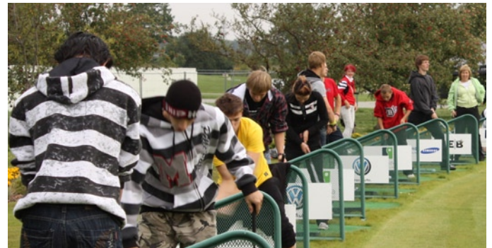
The pupils have also had a chance to try out golf. They were invited by the British Chamber of Commerce in Riga to the Saliens golf course on September 6.

A special thanks to this year's main sponsor SEB.