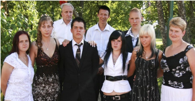
Kitchen assistants and painters finish school in June.

Trust, Knowledge, Self-esteem, Self-confidence, Initiative, Responsibility, Creativity, Co-operation