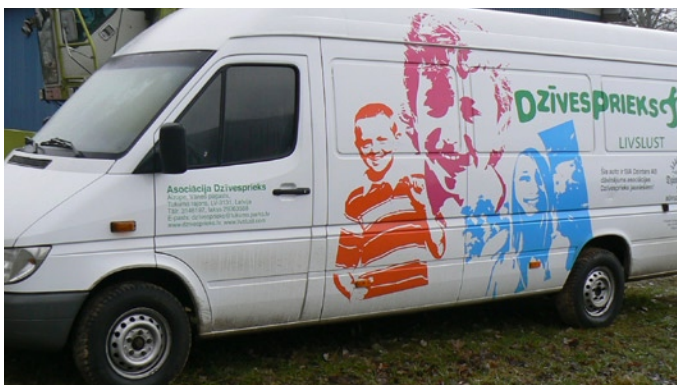
We have received this mini-bus from the Latvian company Dzintars Sia.

can be ordered from our office at livslust@telia.com